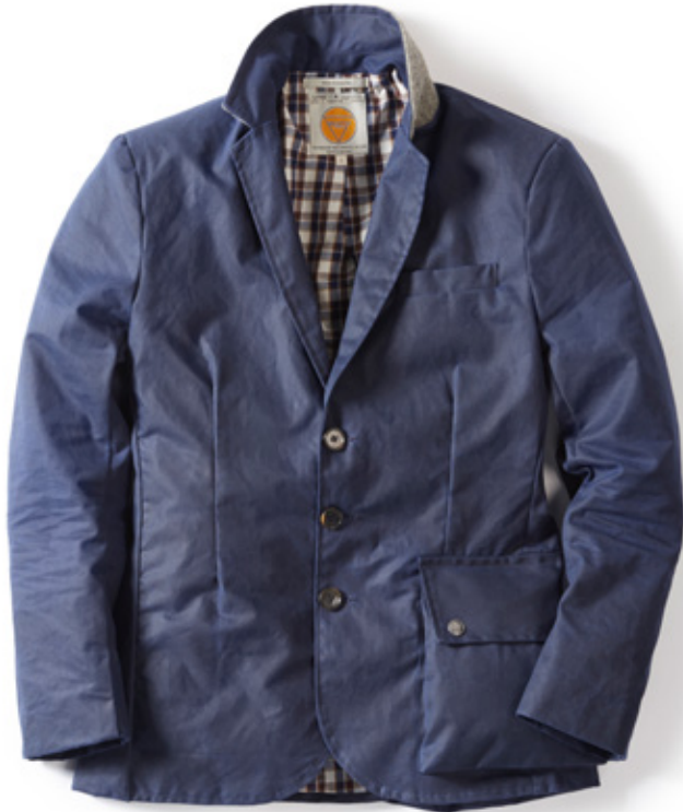
Walklett Tailored Jacket