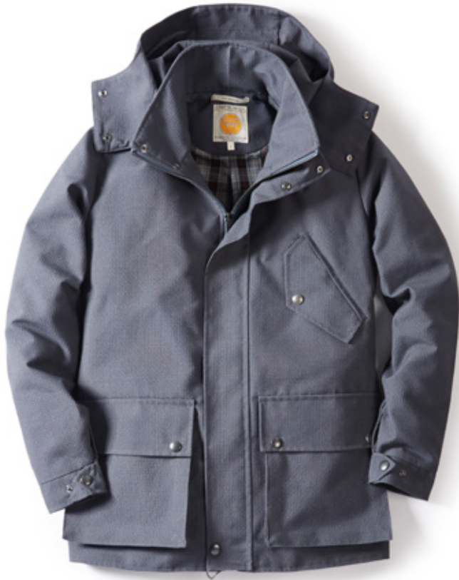
Titan Track Coat