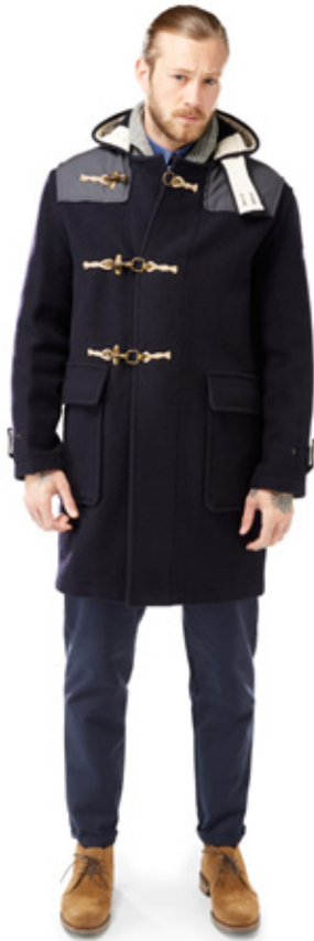
Ginetta Duffle Coat