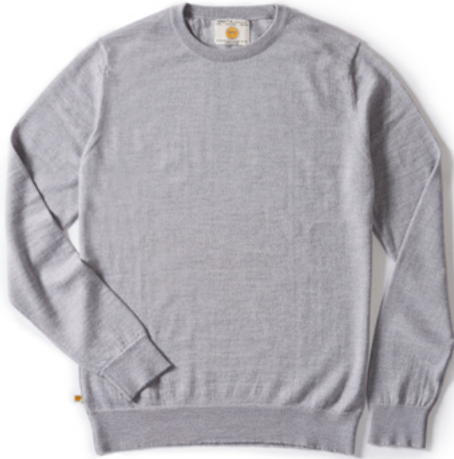
Fine Gauge Merino Knitwear